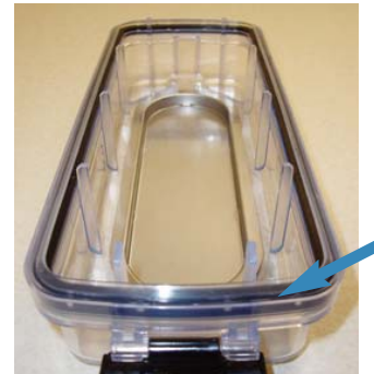
BLACK MIDDLE SEAL