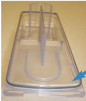
BLUE MIDDLE SEAL