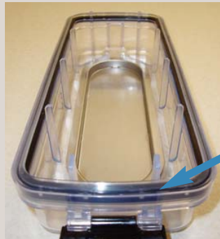
BLACK MIDDLE SEAL